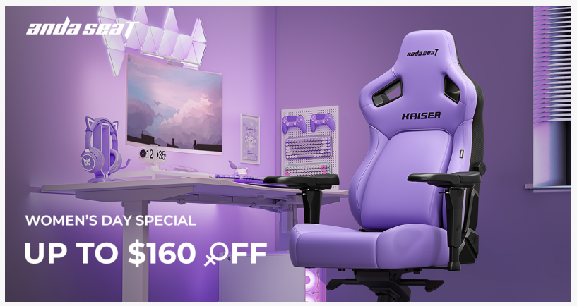
AndaSeat Women's Day Kaiser 4