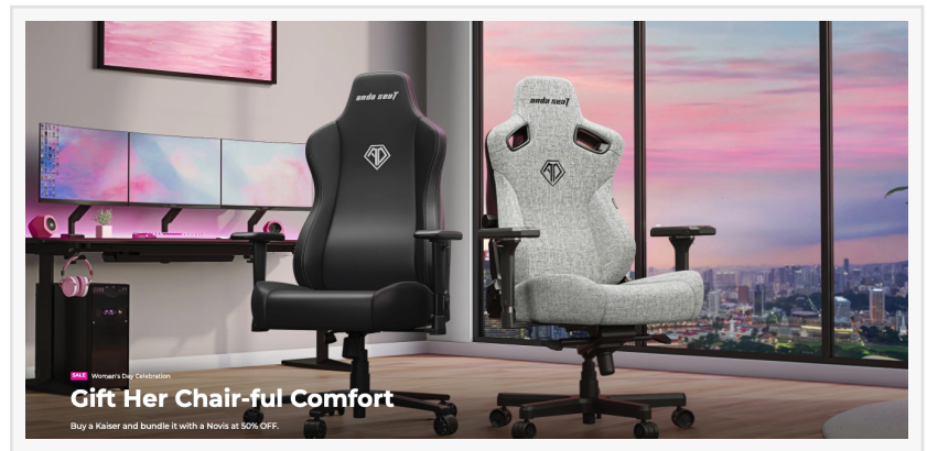
AndaSeat Women's Day 2025

The Kaiser 4 is built with long-term performance in mind, featuring a highly adaptive lumbar support system with four levels of pop-out