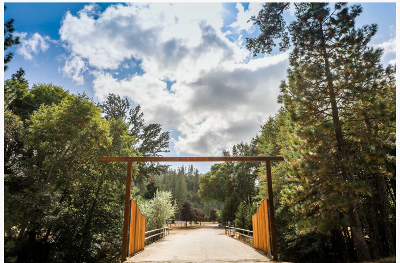
Mandala Springs Wellness Retreat Center