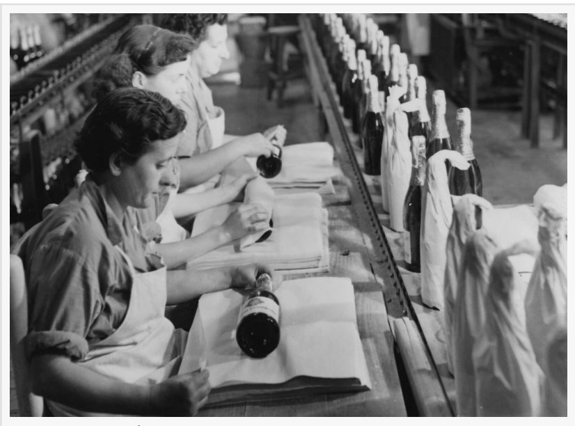
Women working at D.O. Cava

Women have long played an essential role in this industry, often taking the reins of family wineries and elevating Cava to the highest levels of excellence or preserving artisanal traditions of Jamón ConsorcioSerrano.