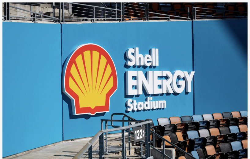
Custom Signage for Shell Energy Stadium