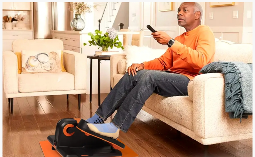
Watch TV while using Tousains Mini Elliptical Machine