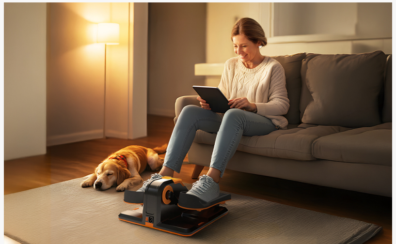
Tousains Mini Elliptical Machine for seniors

7-speed levels provide gentle movements on the legs, suitable for rehabilitation or staying