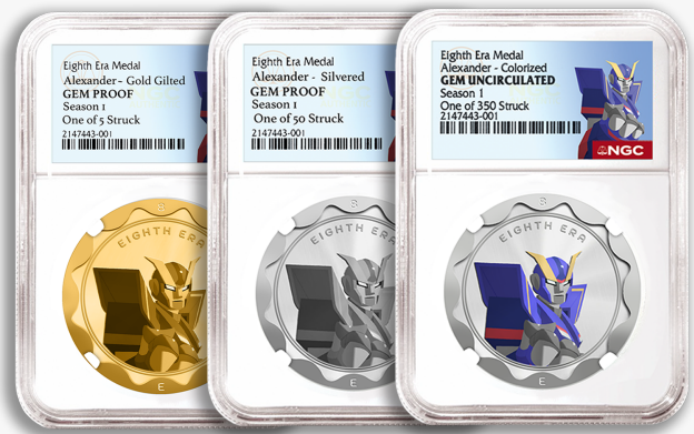
Eighth Era Alexander Physical Collectible Coin Stack