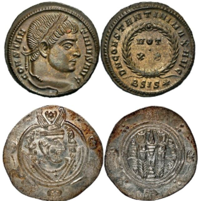
Eighth Era Tournament Rewards the Constantine 1 portrait coin and the Tabaristan Hemidrachm.