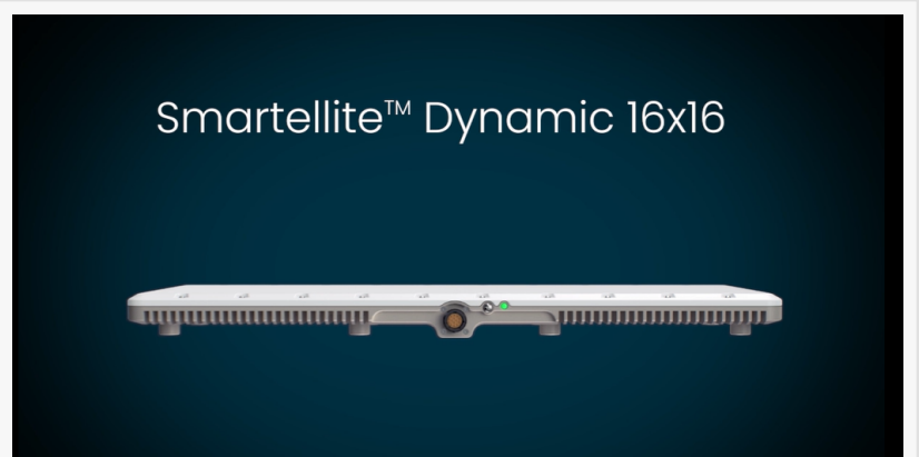
hiSky's Smartellite Dynamic 16X16 Terminal