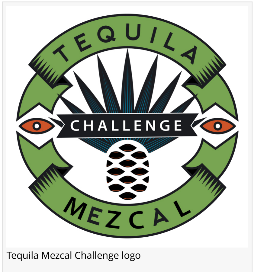
Tequila Mezcal Challenge logo

BROOMFIELD, Colorado—Wine Country Network, publisher of Wine Country International® Magazine and a global leader in producing professional beverage competitions for wines and spirits, has announced that it is now accepting entries for the 2025 Tequila Mezcal Challenge. The competition has over sixty categories of Tequila, Mezcal, Agave Spirits, and ready-to-drink (RTD) Premixed Cocktails.