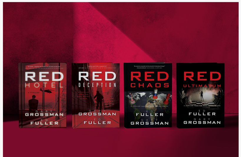
4 Books of the Red Hotel Series