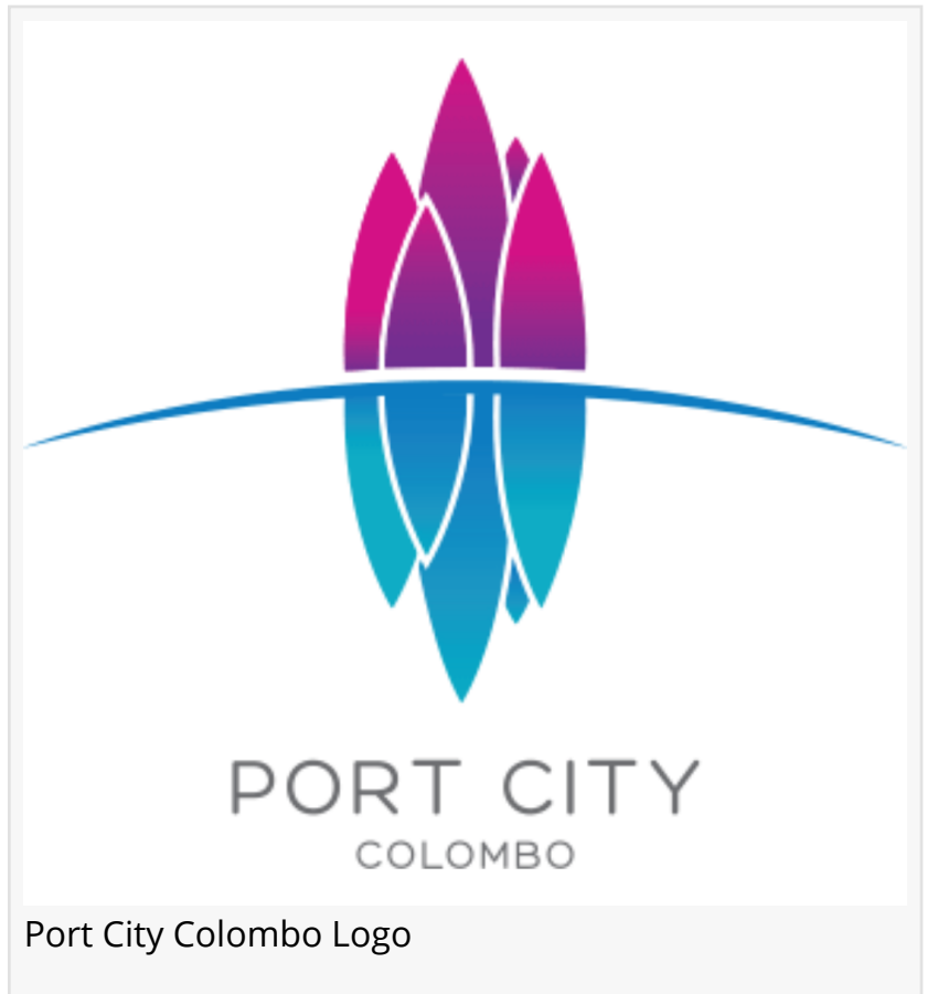
Port City Colombo Logo

Additionally, PCC boasts South Asia's first downtown duty-free retail destination, The Mall at Port City Colombo, which opened in September 2024, and the region's first Luxury Yacht Marina, which commenced construction in January 2025. The upcoming Business Center, a premier IT and commercial park, will be ready for tenants by Q1 2025, further solidifying PCC as a regional economic powerhouse.