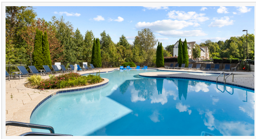
Community upgrades include a resurfaced resortstyle pool, offering residents a luxury retreat