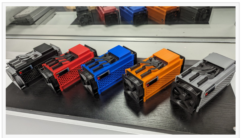
5 Minibits powered by Bitaxe, side by side, in different colors

D-Central Technologies has long been at the forefront of the pleb mining movement, advocating for greater