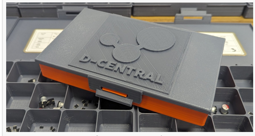
Bitaxe DIY Kit Case from D-Central

accessibility and efficiency in Bitcoin mining. The upcoming product line represents the most diverse and powerful suite of home mining devices the company has ever developed. The incoming miners include: