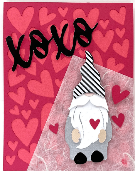
CARMINE ROSE - Smooth 12x12 Cardstock - Bazzill Smoothies Collection