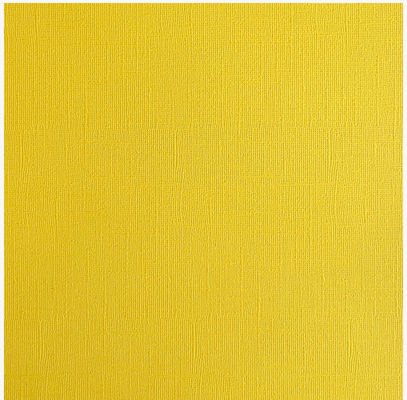
LEMON TWIST - Textured 12x12 Cardstock - Encore Paper

Paper sourcing plays a crucial role in sustainability efforts. 12 x 12 Cardstock Shop collaborates