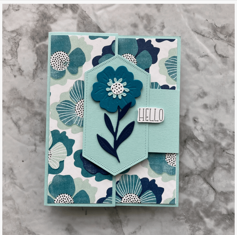
PASTEL BLUE- Smooth 12x12 Cardstock - Bazzill Smoothies Collection

Packaging waste remains a significant concern across industries. In response, 12 x 12 Cardstock Shop has introduced alternatives designed to minimize excess material use. Paper-based adhesives and compostable packing materials have replaced conventional