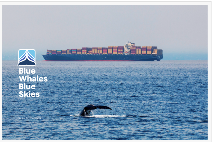
Container ship and whale fluke

Ship strikes are a major contributor of mortality to whales around the globe and are especially of concern in whale hotspots that overlap with major international shipping routes. However, if large vessels reduce their speeds to 10 knots or less in these areas when the likelihood of whale presence is highest, the risk of fatal