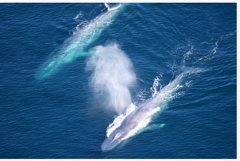
Two blue whales in Channel Islands National Marine Sanctuary

The Vessel Speed Reduction (VSR) Season is designed to coincide with endangered whale migration as well as peak ozone seasons for California coastal communities. In the 2024 Season, BWBS verified that 743 vessels, across 49 of the world's largest shipping lines, opted-in to reduce their speeds. BWBS' 2024 Season – the program's 10-year anniversary – was the most significant yet, marking a jump in total participating shipping lines – from 33 to 49 – and an increase in distance traveled at "whale-safer" speeds.