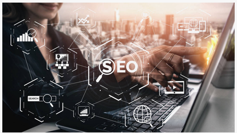
Search Engine Optimization

Integrating AI-driven chatbots enhances client engagement by providing instant responses to inquiries. This technology streamlines communication and allows attorneys to focus on more