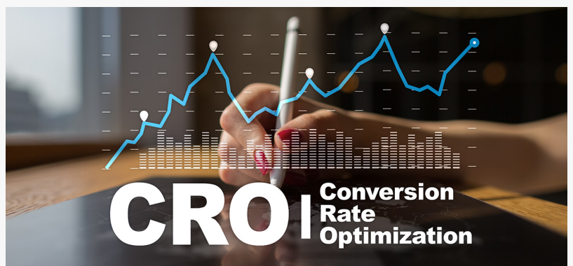
Conversion Rate Optimization