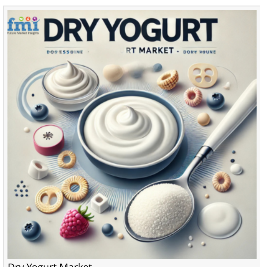
Dry Yogurt Market

According to industry estimates, the market, valued at USD 840.0 million in 2025, is expected to reach USD 1,683.5 million by 2035, registering a CAGR of 7.2% from 2025 to 2035. This expansion is fueled by rising health consciousness and increasing demand for functional foods across various regions.