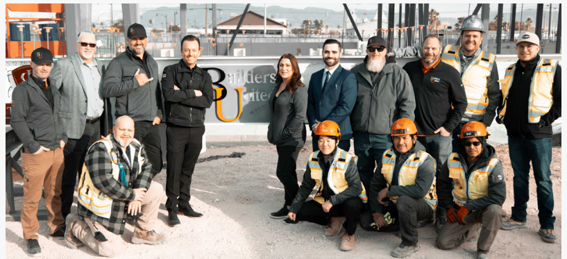
Builders United Team