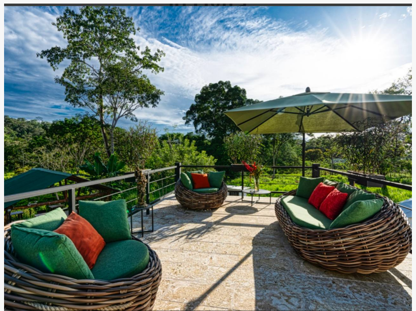
Zen Sundeck Costa Rica

PALM BEACH, FL, UNITED STATES, February 13, 2025 /EINPresswire.com/ -- Inspire Health Retreats is thrilled to announce its official launch with an immersive retreat experience led by medical doctors and practitioners certified in holistic healing modalities. This dynamic retreat invites couples, friends, and solo-travelers to explore a sense of self-compassion, shared adventures, and to build lifelong healthy habits together. Although, Valentine's Day is considered to be a commercial holiday, it serves as reminder that love, especially self-love and care are of utmost importance to foster longevity and vitality for self and and for a healthier society.