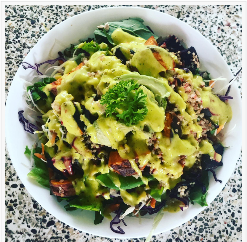
Costa Rica Farm To Table

This press release can be viewed online at: https://www.einpresswire.com/article/785805547