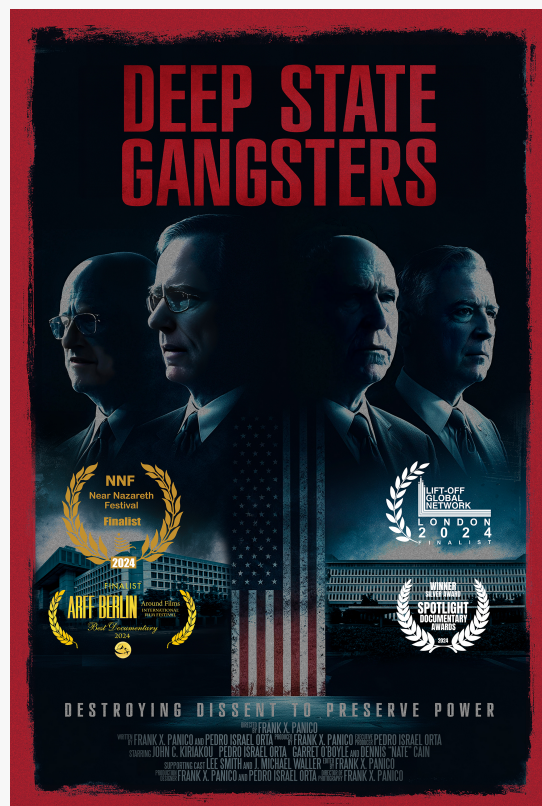
Deep State Gangsters