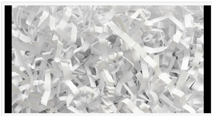
professional paper shredding company in LA

The company's commitment to innovation doesn't stop with its shredding machines. Each stage of the shredding process is monitored to ensure accountability, and all shredded materials are completely irrecoverable, guaranteeing the safety of all client data. This security infrastructure makes Williams Data Management an industry leader.