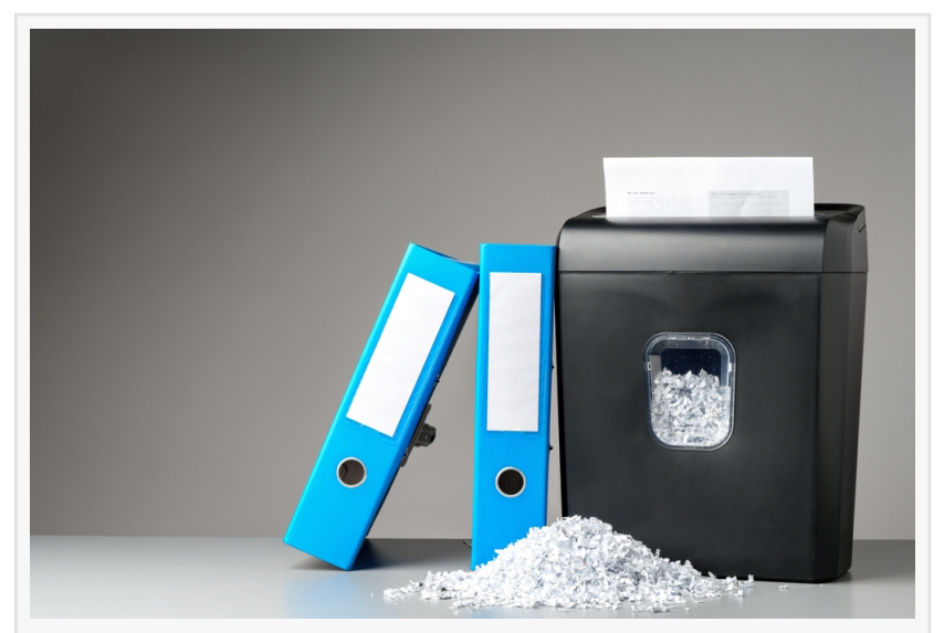
Shredding Services company 1

In today's world, where data breaches and identity theft continue to rise, proper disposal of documents containing sensitive or personal information is a critical concern for businesses and individuals. As a