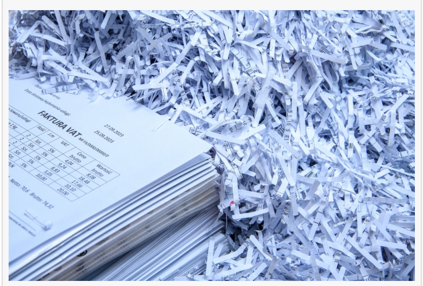
Professional Document Shredding 1

professional paper shredding company in LA, Williams Data Management is dedicated to providing professional shredding services that cater to both large enterprises and small businesses, as well as individuals seeking secure document destruction. With its strong focus on confidentiality, compliance, and efficiency, the company plays a vital role in safeguarding sensitive data throughout the region.