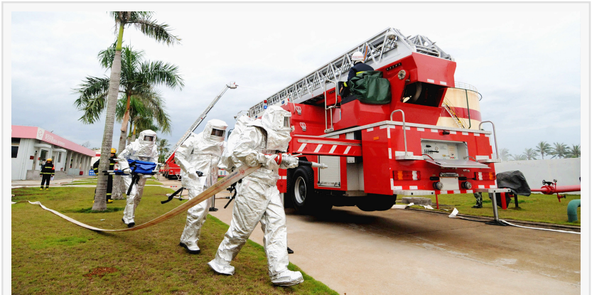
Aerial Fire Truck

SUIZHOU, HUBEI, CHINA, February 16, 2025 /EINPresswire.com/ -- CSCTRUCK , a global leader in specialized vehicle manufacturing, is thrilled to announce that its Fire Truck Branch has successfully achieved its 2024 strategic goals ahead of schedule. This milestone highlights the branch's commitment to innovation, safety, and excellence in delivering advanced firefighting solutions to customers worldwide. By surpassing production, technological, and market expansion targets, the Fire Truck Branch has reinforced its position as a trusted partner for fire departments and emergency response teams.