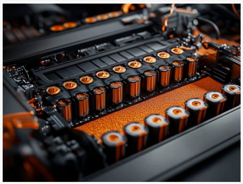
Concept Example B Example of integrated ThermaGEL granular material packed in battery array to protect against thermal runaway

"I'm excited to join ThermaGEL and grow this great team at such a dynamic