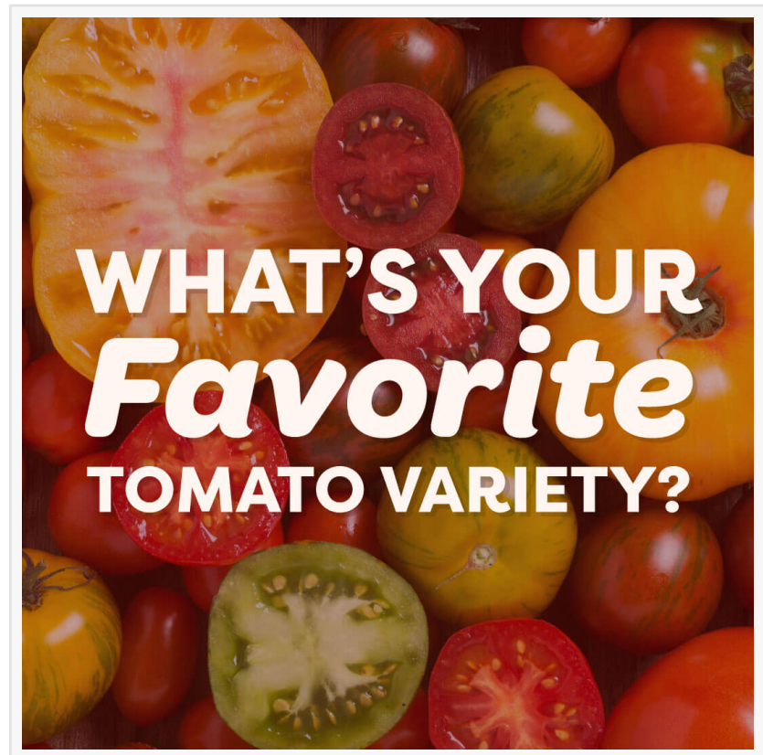
Choose from over 300 varieties of tomato seedlings. You won't find them at the local grocery store!

- Learn growing techniques from the experts.