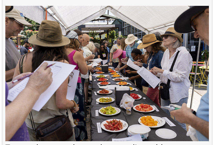
Tomato lovers gather at the sampling table.