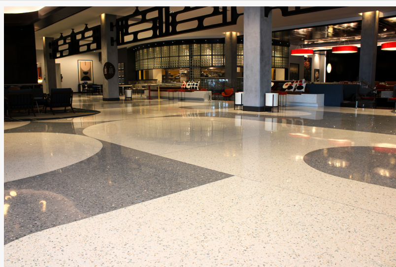
HILTON Buena Park in Buena Park, Calif., incorporated 1970s style patterning in a remodel to complement a refined retro interior.

This press release can be viewed online at: https://www.einpresswire.com/article/784124387