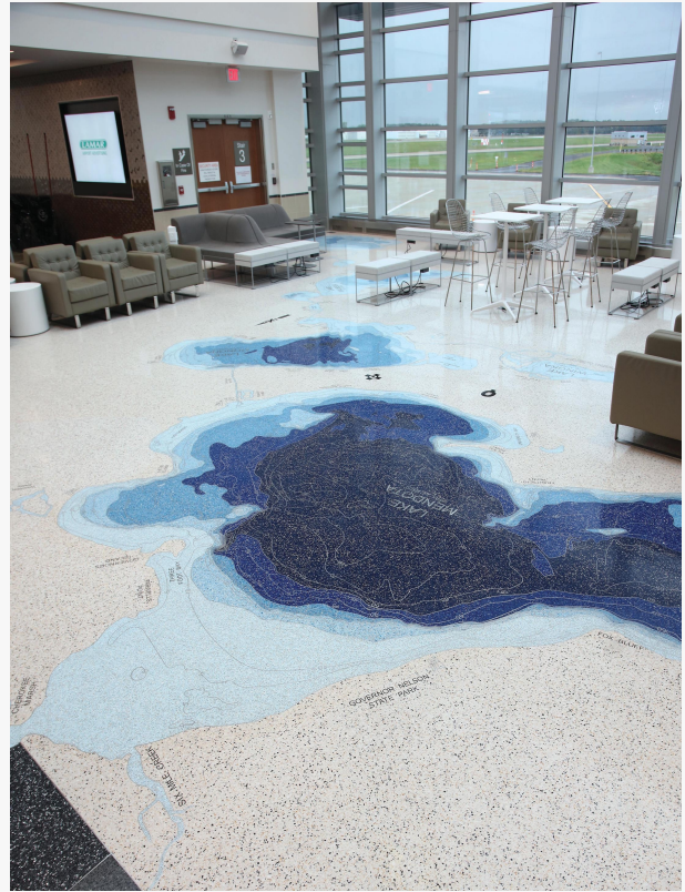
A TOPOGRAPHICAL MAP in terrazzo accents the interior of Dane County Regional Airport in Madison, Wis.