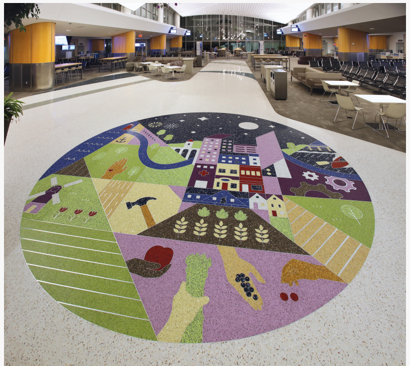
COMMISSIONED ART in terrazzo by local artists distinguishes a winning installation at Gerald R. Ford International Airport in Grand Rapids, Mich.