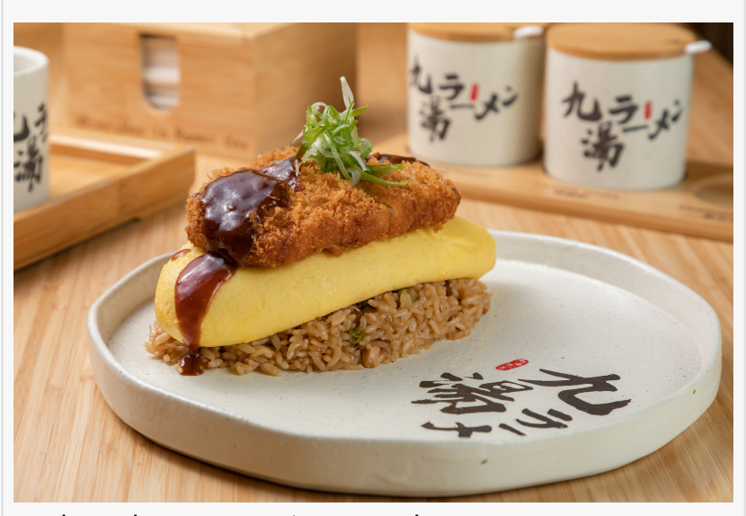
Pork Tonkatsu Omurice (Popular)

"We are excited to bring Kyuramen to California, continuing our mission of making Japanese ramen accessible to all across the U.S.," said the company's spokesperson. "Being the birthplace of the 626 Night Market and home to a multicultural population, Arcadia has a strong appreciation for quality and diverse culinary experiences. It is the perfect place to begin our