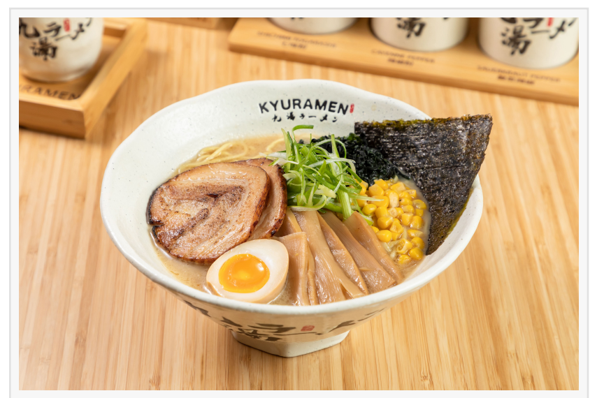
#1 Toyko Tonkotsu Shouyu Ramen (Best Seller)

The first Kyuramen opened in New York City in 2019 with it's signature dish, the #1 Tokyo Tonkotsu Shouyu Ramen, which now has sold over half a million bowls nationwide. Within five years, Kyuramen has expanded to 40 locations around the United States and amassed over 151k Instagram followers.