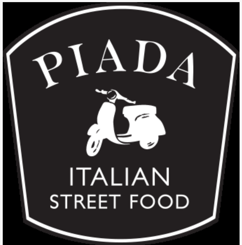
Piada Italian Street Food Logo