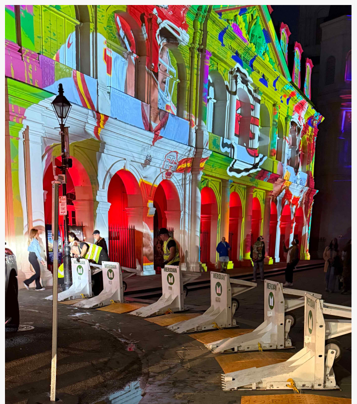
New Orleans Barrier Set Up