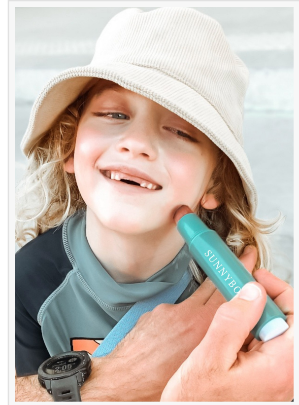
SUNNYBOD REFILLABLE SUNSCREEN BRUSH APPLICATOR

Addressing the ongoing challenge of effective sun protection, Australian-founded brand SUNNYBOD™ has launched an innovative refillable sunscreen brush, designed to make sunscreen application easier, cleaner, and more accessible. Inspired by a personal connection to melanoma prevention, SUNNYBOD seeks to improve sun safety habits for families and individuals alike.