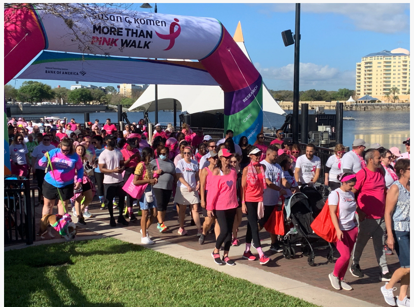
Orlando MORE THAN PINK Walk