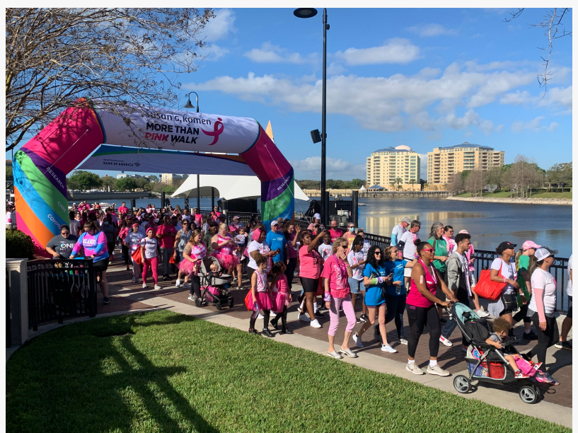
Orlando MORE THAN PINK Walk