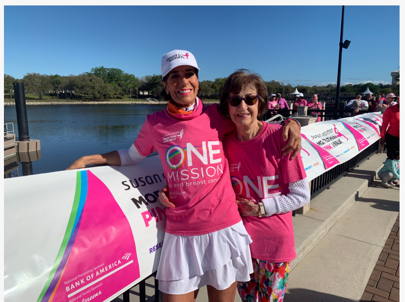
Orlando MORE THAN PINK Walk