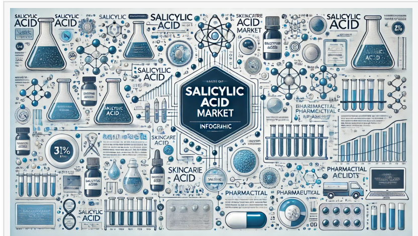
Salicylic Acid Market Size

Salicylic acid, a versatile compound, has found increasing applications across diverse industries, including pharmaceuticals, skincare, and food preservation, leading to its growing demand and expanding market share. With a proven track record in addressing various consumer needs, the salicylic acid market is poised for a bright future, fueled by a multitude of emerging trends and consumer demands.