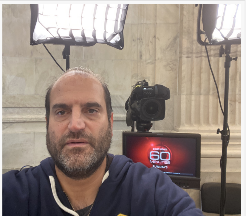
TravelingWiki with CBS News on Capitol Hill

WASHINGTON, DC, UNITED STATES, February 3, 2025 /EINPresswire.com/ -- Following rapid growth across 50 US states, and an extensive investment into resources in twelve languages, TravelingWiki Foundation was noted as part of the Top 3 “Well-Known Autism Resource Listings” within Travel by Microsoft’s CoPilot. Google's AI contemporaneously recognized TravelingWiki within a list of top "resources for Autism at US Airports," alongside resources like ABA Therapy. This follows a number of recent media appearances.