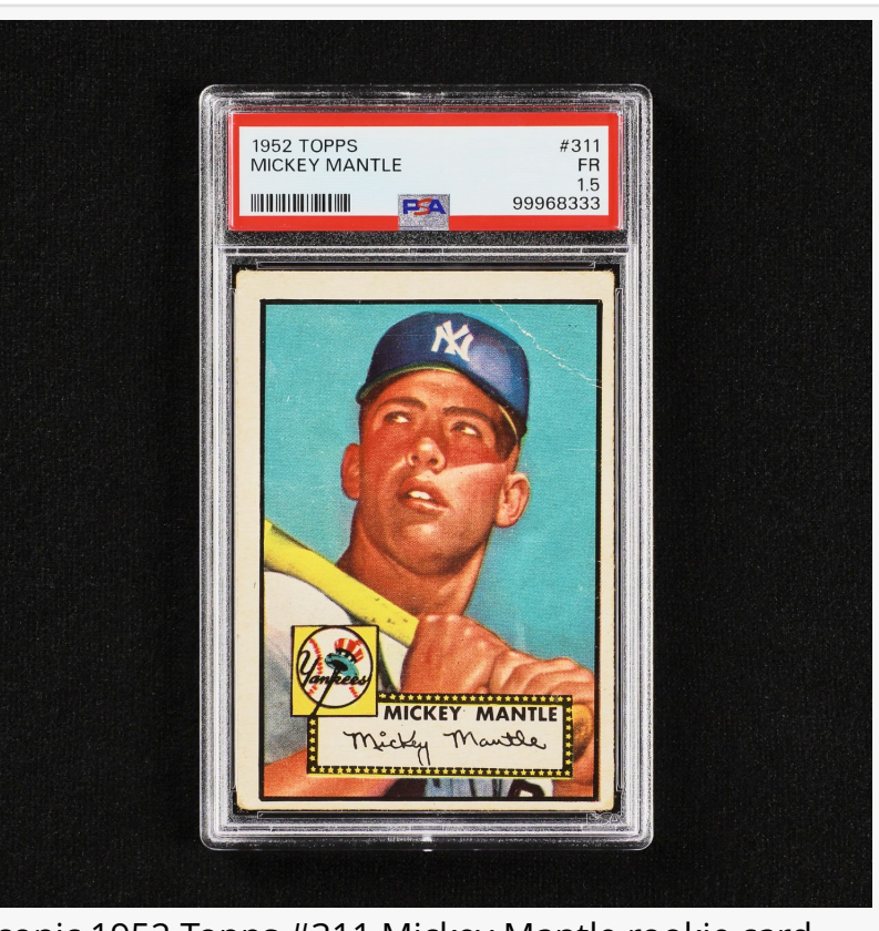
Iconic 1952 Topps #311 Mickey Mantle rookie card, regarded as one of the most significant in the world of baseball card collecting, graded PSA 1.5 Fair condition (CA$50,150).

baseball cards (including the rare #253 Mickey Mantle rookie card, graded PSA 4.5 VG-EX+, a PSA graded 6 EX-MT Ted Williams card and a PSA graded 5 Yogi Berra card, plus other Hall of Famers), sold for $38,350, besting the $25,000 high estimate.