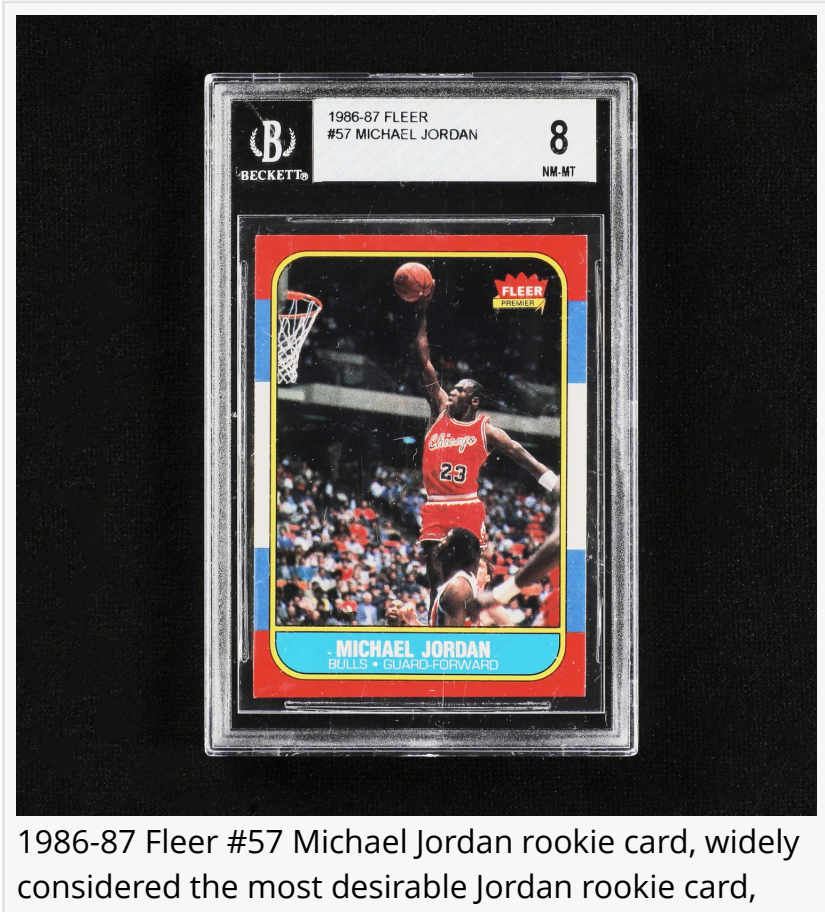
1986-87 Fleer #57 Michael Jordan rookie card, widely considered the most desirable Jordan rookie card, graded Beckett 8 in Near Mint-Mint condition. (CA$8,850).

This press release can be viewed online at: https://www.einpresswire.com/article/781763987