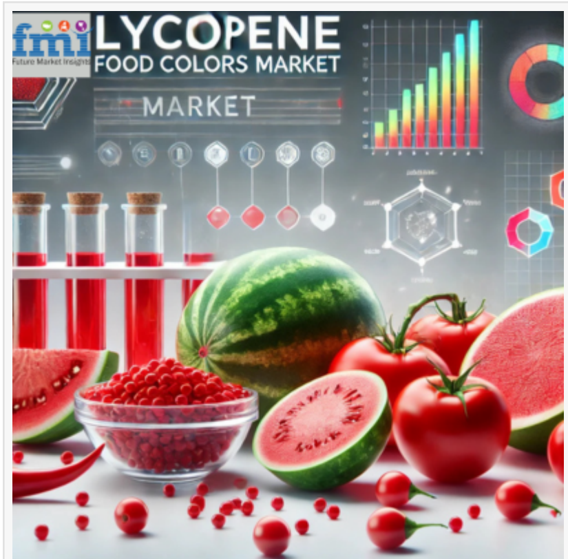
Lycopene Food Colors Market

The rising preference for natural food colors is primarily due to increasing consumer awareness regarding the potential health risks associated with synthetic additives. Lycopene, a potent antioxidant derived from tomatoes and red fruits, is gaining traction due to its ability to offer vibrant red hues while providing health benefits such as anti-inflammatory and cardiovascular support. The demand for lycopene-