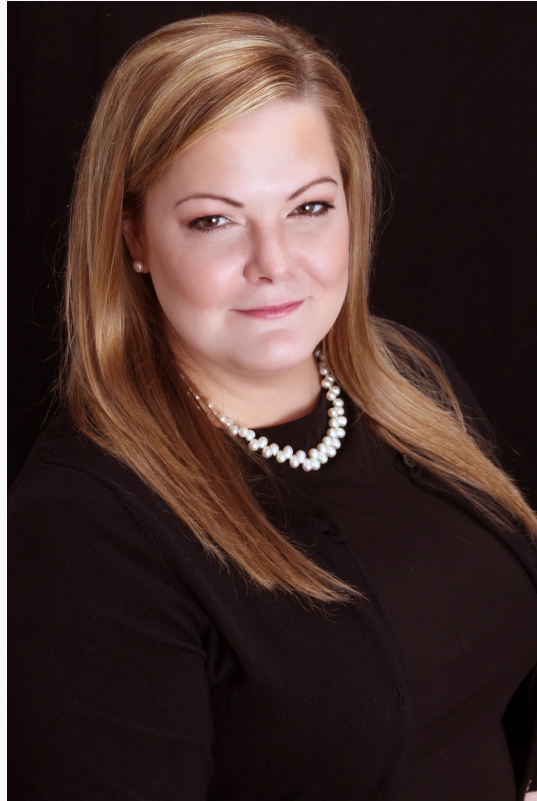
Vice President - Division Lending Manager