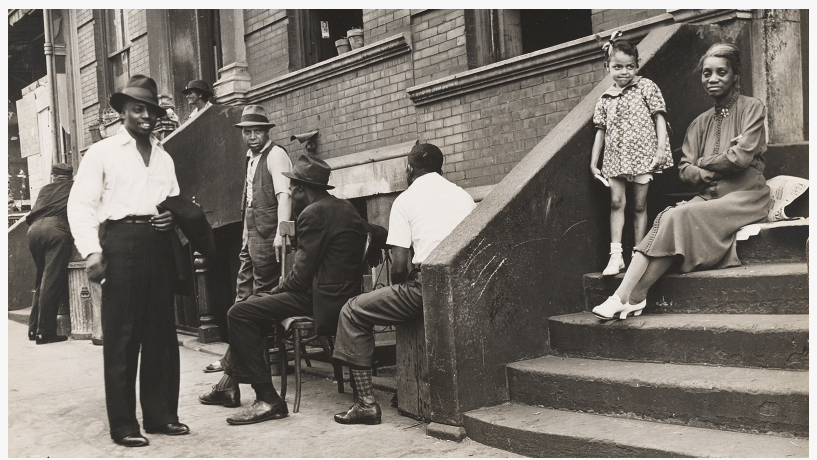
San Juan Hill: Manhattan's Lost Neighborhood

• The Ongoing Fight for Justice: The series powerfully addresses the continued struggle for racial justice in America. "Fighting For Respect: African Americans in WWI" highlights the bravery of Black soldiers who faced discrimination at home despite getting recognition for their bravery abroad. The Oscar-nominated documentary