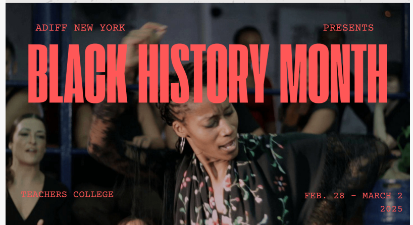
Black History Month: Feb. 28 - Mar 2

NEW YORK, NY, UNITED STATES, February 3, 2025 /EINPresswire.com/ -- The African Diaspora International Film Festival ( ADIFF ) is proud to announce its Black History Month film series, a powerful and thought-provoking lineup that celebrates Black history with an Afrocentric lens. Running from February 28th to March 2nd at 408 Zankel, Teachers College, Columbia University , this series offers a unique opportunity to engage with vital stories and perspectives often marginalized in mainstream narratives.