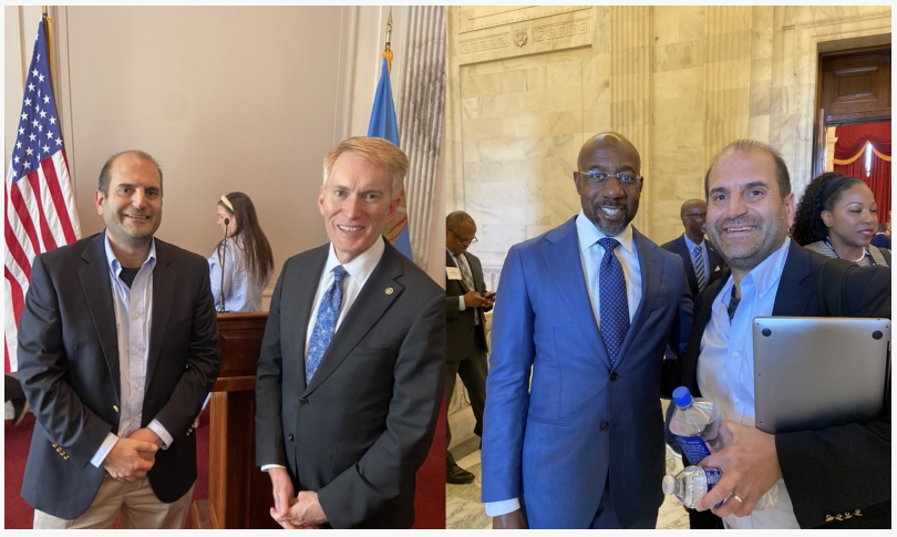
Alongside Extensive Work Attempting to Make Resources Available in the Jewish Community, TravelingWiki Engaging the Two Ordained Ministers Serving as US Senators (Sen. Lankford & Sen. Warnock)