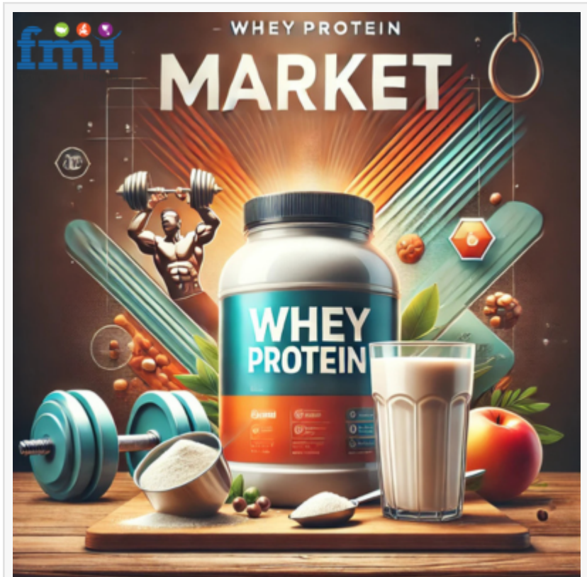
Whey Protein Market

Whey protein also helps maintain blood sugar levels, especially if taken before or with high-