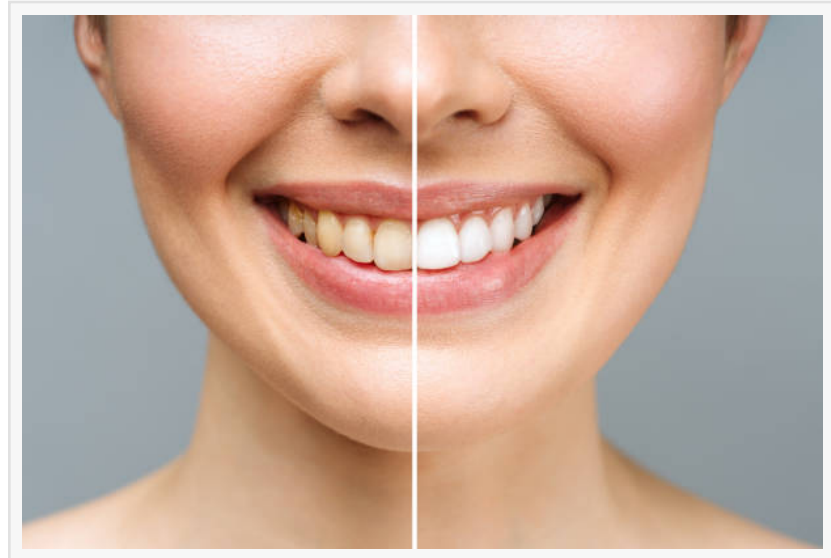
teeth whitening tribeca

Tribeca Smiles takes a holistic view of TMJ disorders, recognizing the interconnected nature of oral health and overall well-being. Many patients experience secondary symptoms, including neck pain and sleep disturbances, which are also addressed in the treatment plan. This comprehensive approach ensures long-term relief and restored function.