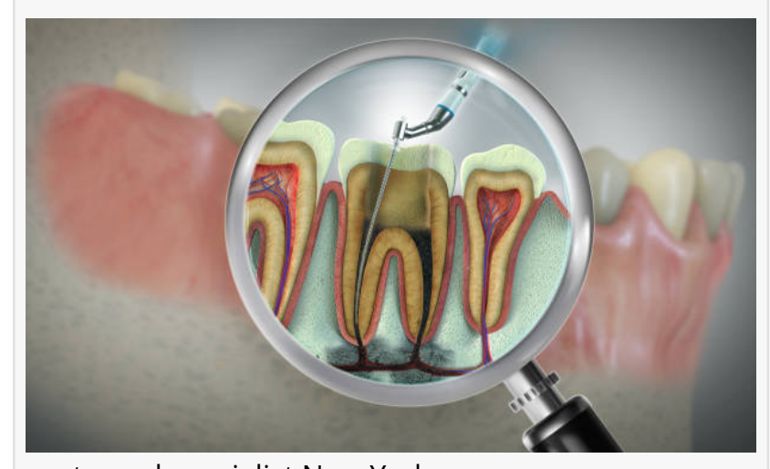
root canal specialist New York

The Temporomandibular Joint (TMJ) plays a critical role in daily functions such as chewing, speaking, and facial expressions. When this joint becomes dysfunctional, the resulting disorder (TMD) can cause significant discomfort, including jaw pain, frequent headaches, earaches, and limited jaw movement. At Tribeca Smiles, managing TMJ disorders involves a comprehensive, patient-centered approach.