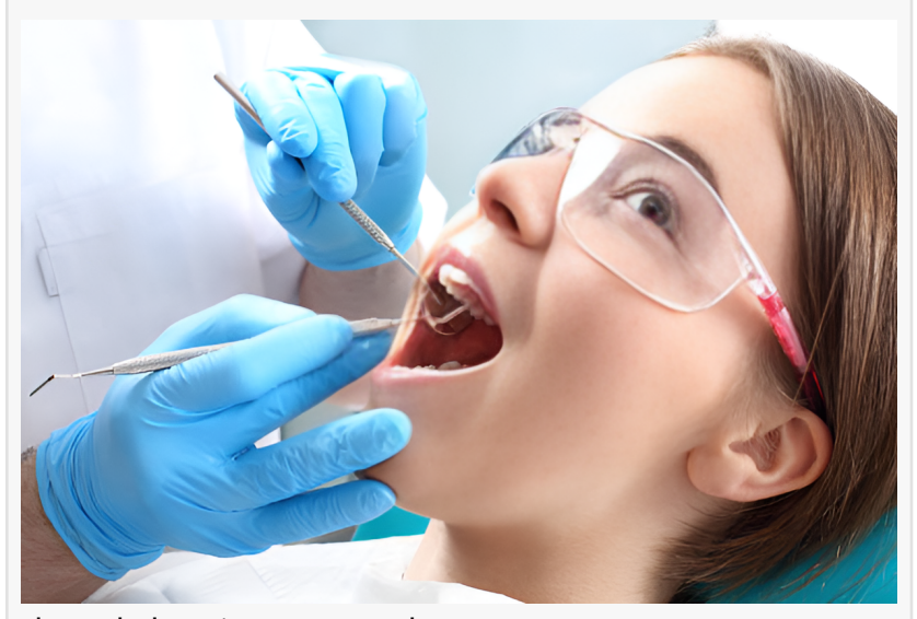
dental cleaning new york