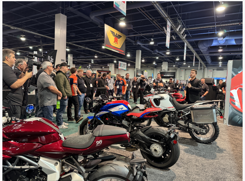
AIMExpo attendees learn about new motorcycles at last year's show.