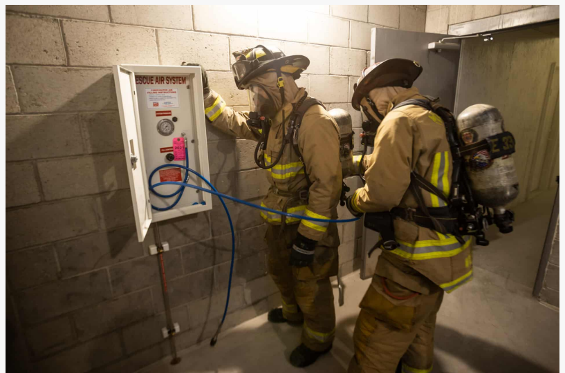
Connecting to Air Standpipe

FAC training focus is focused on air management in operations, strategy and tactics to enhance firefighters' ability to operate in hazardous environments, reduce the risk of toxic smoke exposures and ensure that firefighters maintain peak performance during extended operations.