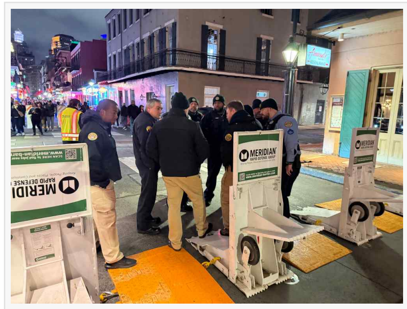
Training and Planning with Archer Barriers

Soon after the New Year's Day tragedy, Mayor LaToya Cantrell announced that Mardi Gras had been upgraded to a SEAR-1 security event, a top rating given to events of national or international importance. This change