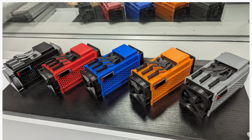
5 Minibits powered by Bitaxe, side by side, in different colors