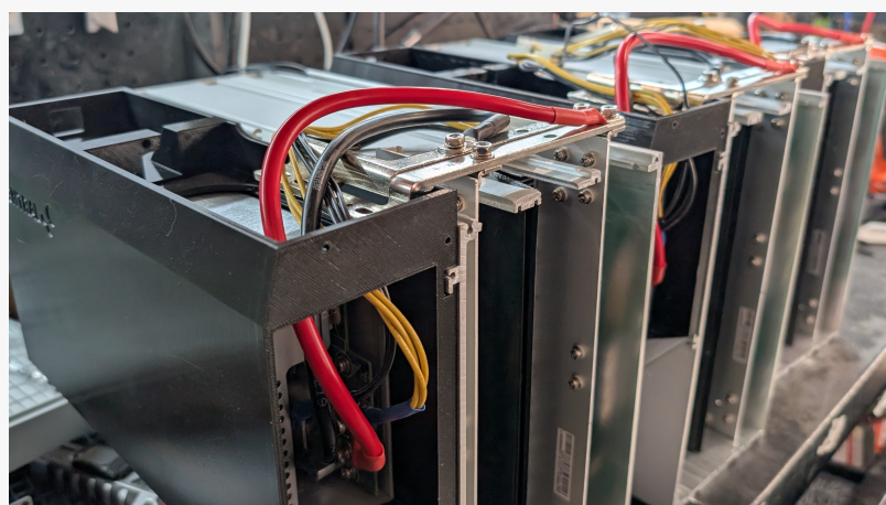
Antminer Loki Rig Mods with APW3 Side Hodler

D-Central Technologies, with years of experience in Bitcoin mining hosting, ASIC repairs, and 3D printing, has developed a comprehensive suite of products tailored for home miners. Among these innovations is the Bitcoin Mining Heater , a device that addresses real-world challenges such as heating expenses by allowing users to mine Bitcoin while efficiently warming their homes. This dual-purpose solution exemplifies D-Central's commitment to practical and sustainable mining technologies.