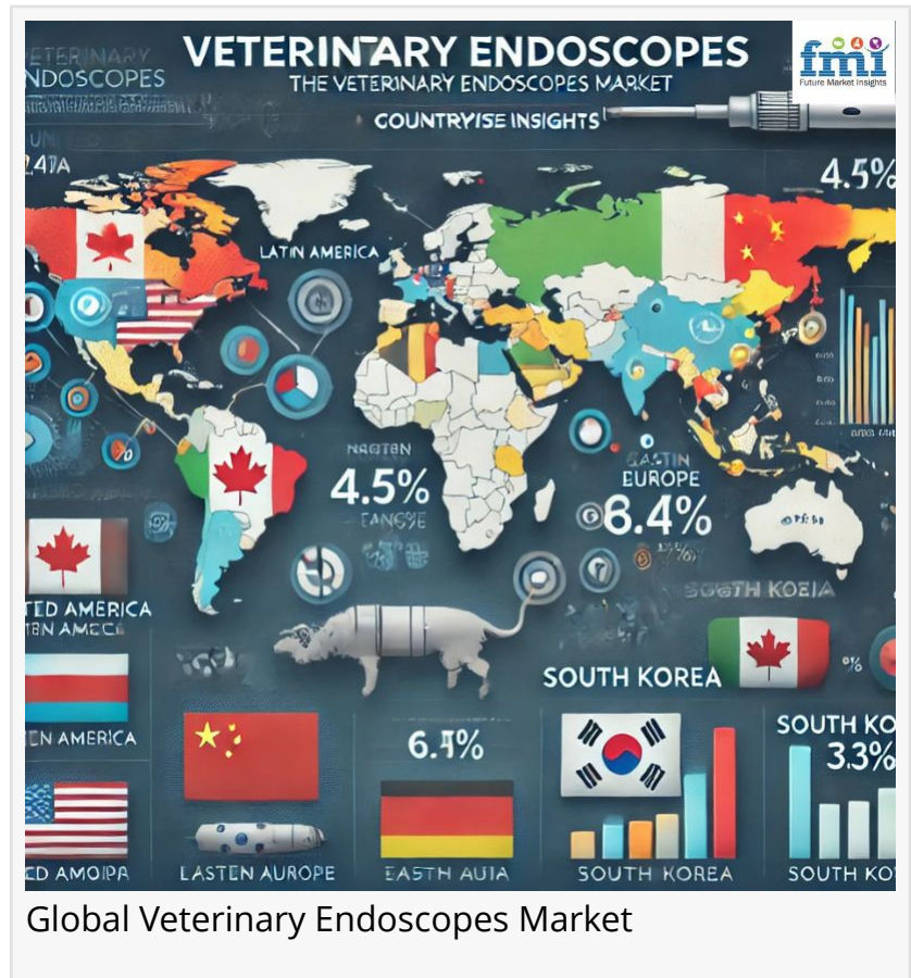
Global Veterinary Endoscopes Market