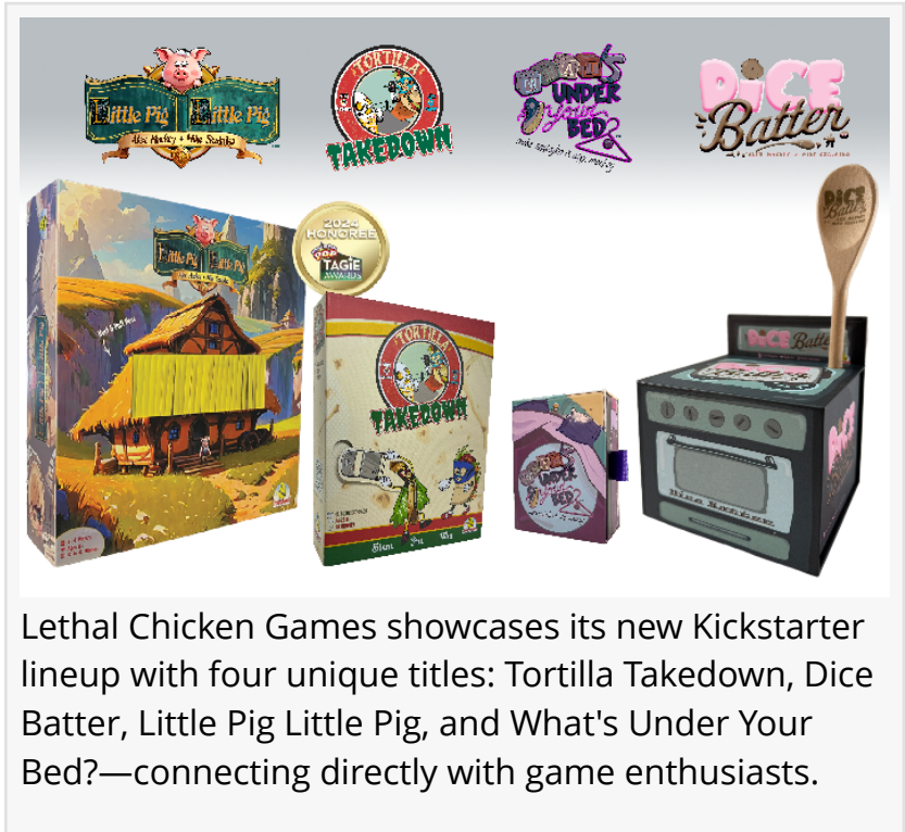
Lethal Chicken Games showcases its new Kickstarter lineup with four unique titles: Tortilla Takedown, Dice Batter, Little Pig Little Pig, and What's Under Your Bed?—connecting directly with game enthusiasts.

LOS ANGELES, CA, UNITED STATES, January 21, 2025 /EINPresswire.com/ -- With former President Donald Trump officially back in office, the toy and game industry has already experienced dramatic shifts, including a brief TikTok shutdown and looming tariff threats on imported goods from China. Indie publisher Lethal Chicken Games is stepping up in this uncertain environment with a Kickstarter campaign that connects fans directly to their four newest titles.