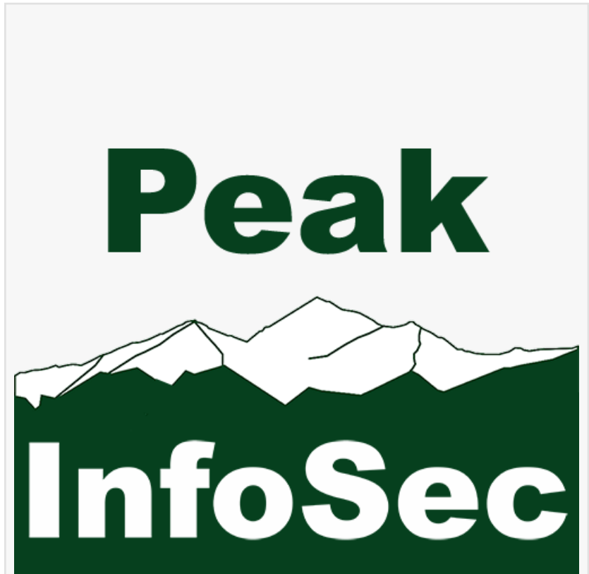
Logo for Peak InfoSec

Through this collaboration, Peak InfoSec will conduct formal CMMC assessments for organizations seeking certification, while Fathom Cyber will provide comprehensive consulting services to help businesses prepare for assessments, develop tailored compliance programs, and ensure ongoing security posture improvements.