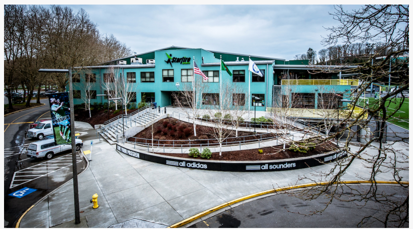
Front of Starfire Sports Entrance