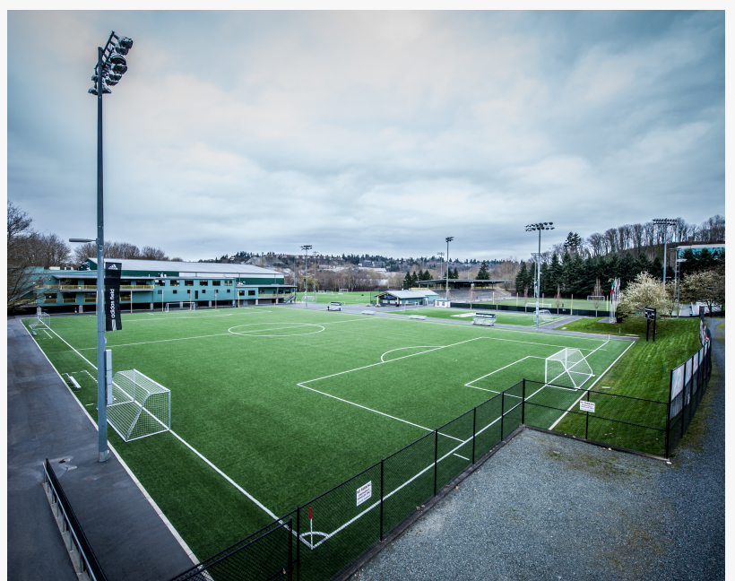
Glimpse of the 54 Acre Starfire Sports Campus

SEATTLE, WA, UNITED STATES, January 20, 2025 /EINPresswire.com/ -- Starfire Sports is proud to announce a groundbreaking partnership with High Level Promotions (HLP). HLP will work exclusively to secure naming rights for the Starfire Sports Campus, further elevating its status as a top-tier youth sports, STEM education, and community hub. HLP's focus is crafting a customized naming rights opportunity to provide partners with maximum visibility and engagement opportunities.