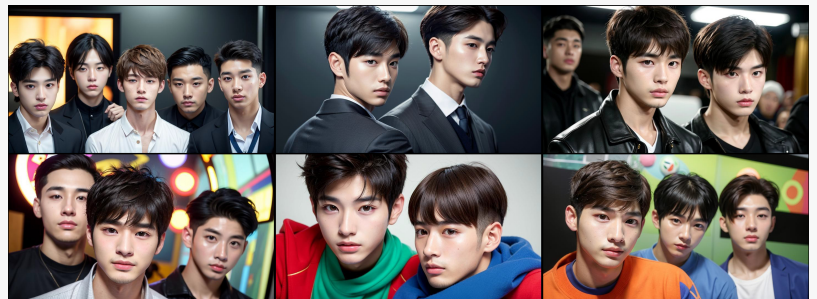
AI IDOL TEAM