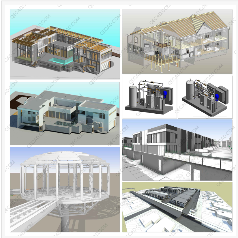
Highlighting the diversity and impact of our projects

Drafting Services: QeCAD provides the detailed and precise drawings to support architectural and engineering workflows thereby ensuring project accuracy from inception to completion.