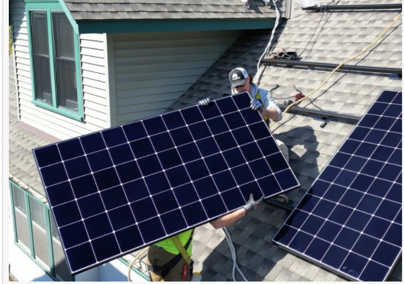
Wolf River Electric Solar Installers

Founded in 2014, Wolf River Electric is a 100% employee-owned company specializing in residential and commercial solar installations. The company serves Minnesota, Wisconsin, Iowa,