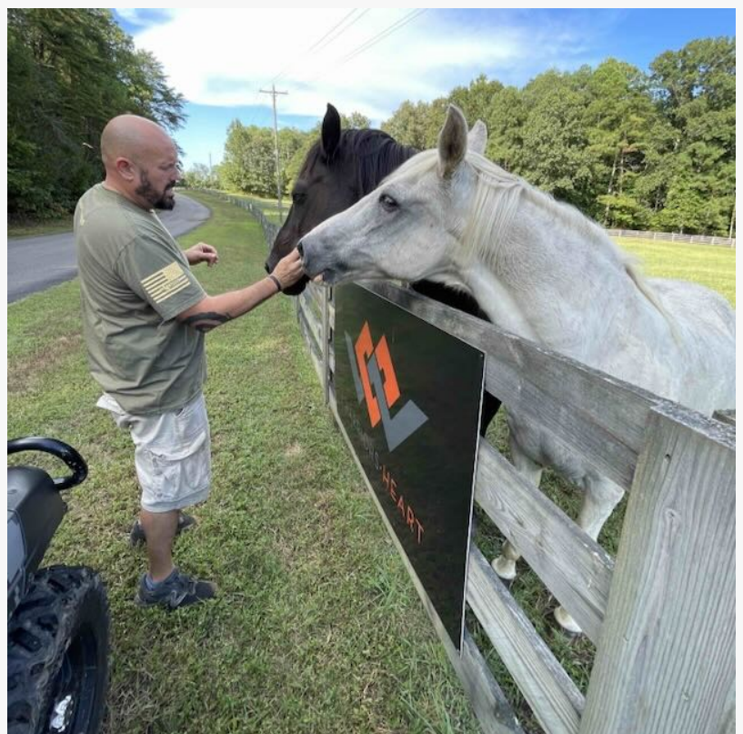
Warriors Heart rehab for veterans, active-duty and first responders adds equine programs to provide new skills for new beginnings in 2025.

As part of a unique holistic healing program exclusively for warriors, clients participate in individual and group therapy with licensed clinicians to address substance abuse, PTSD, mental health, trauma, anxiety, suicide ideation and co-occurring issues. Warriors Heart clients are assigned two therapists, one for substance abuse, and a second one for mental health or co-occurring issues. Clients meet one-on-one with their therapists minimum twice a week, which is well-above the industry standard requirements.